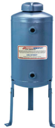
DISHED BOTTOM OUT-STYLE