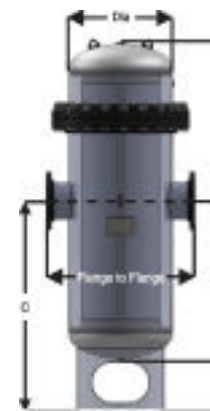
RC - Removable Cover

A complete General Conditions and Warranty statement is available for view at NR- Non Removable Cover www.wheatleyhvac.com