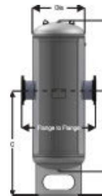
NR - Non Removable Cover